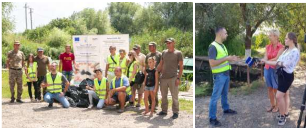
Figure 4. Fishing for litter campaign done by UKRMEPA in Odessa UKRAINE in August 2020.

Ukraine (UKRMEPA) did the fishing for litter campaign in August 2020 (see Figure 4) and the other three countries will do before December 2020. A total of 52 people took part in the action, who collected about 70 bags of garbage, weighing a total of 700 kg,