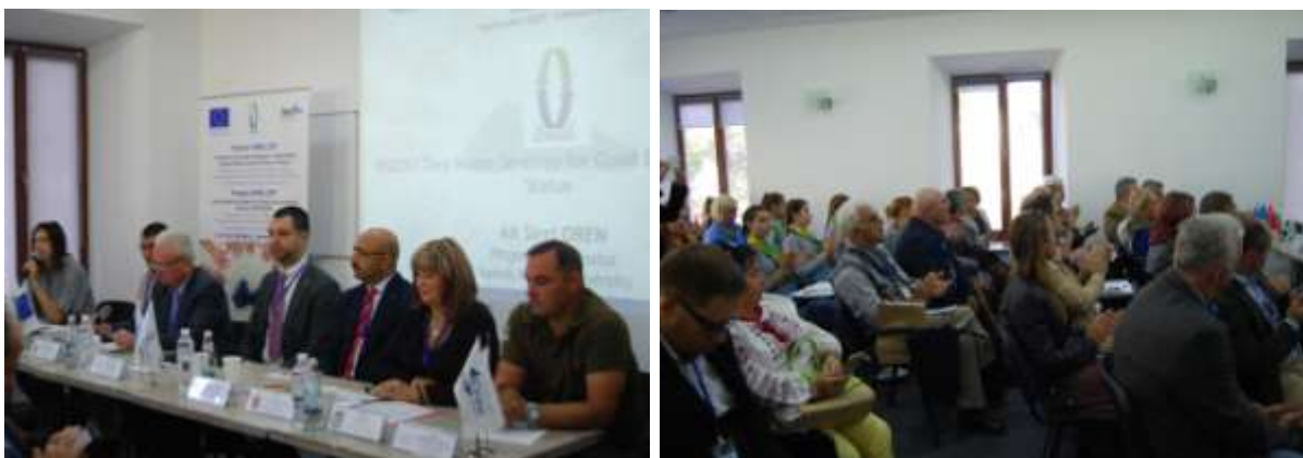
Figure 3. Project Meeting in Burgas-Bulgaria on 14-15 May 2019