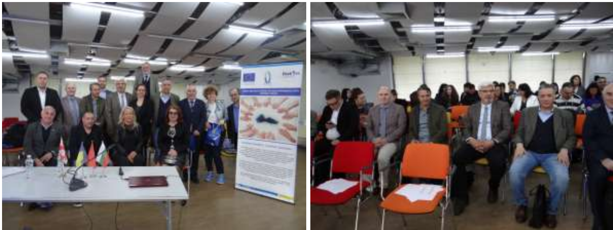
Figure 2. Project Meeting in Burgas-Bulgaria on 14-15 May 2019.

In the Project, 4 workshops, 4 conferences and press conferences, one in each partner country, were planned. Meetings on 14-15 May 2019 in Burgas-Bulgaria (Figure 2) and on 19-20 September 2109 Odessa- Ukraine (Figure 3) were held. The remaining two meetings to be held in Georgia and Turkey will be realised online via WEBINAR, in October 2020 and December 2020, respectively.